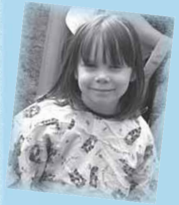
Participants at Health & Safety Day learned about visiting the doctor to stay healthy.

Young guests learned about disaster preparedness from the American Red Cross during the Richmond Health & Safety Day.